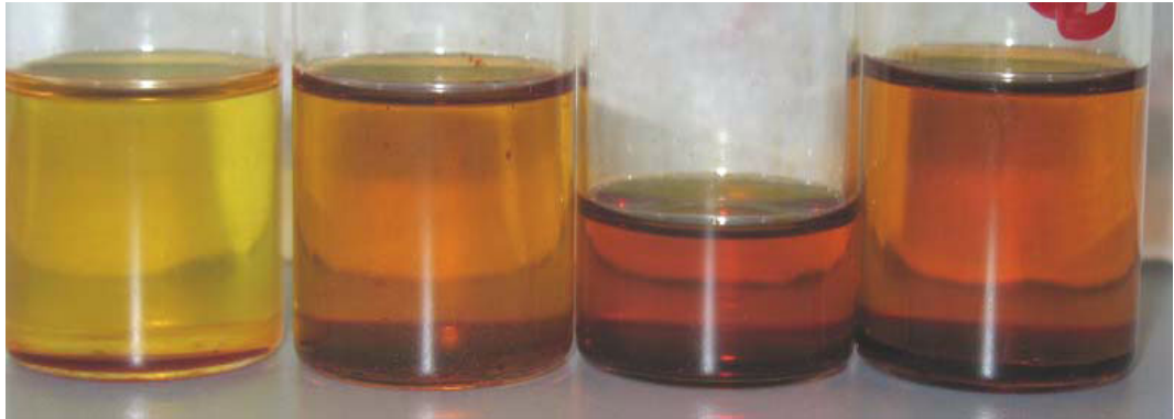
A 1 Change in pure biodiesel in storage at 50°C.

Oxidised fuel parts give it a dark colour.